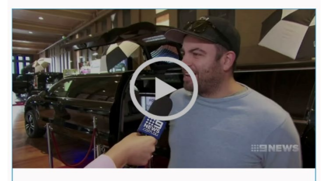
Channel 9 News Melbourne