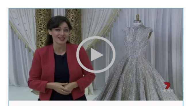
Channel 7 News Melbourne

This incredible gown will again be the show stopping feature at the upcoming Sydney Ultimate Bridal Event, to be staged at the International Convention Centre Sydney this coming weekend.