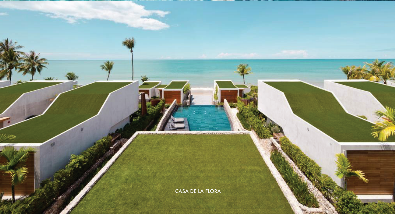
CASA DE LA FLORA